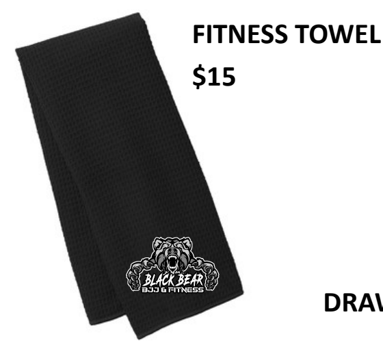
BLACK BEAR BUT OF FITNESS