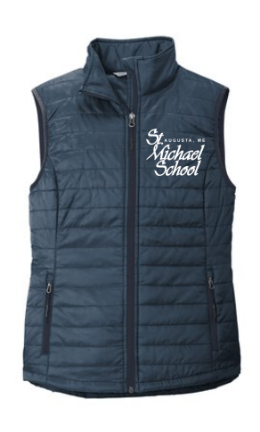
PUFFY VEST $50 LADIES OR ADULT XS-4XL