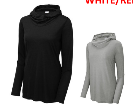
Lst406 LIGHTWEIGHT TRIBLEND HOODIE $25