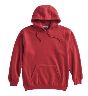
BLACK, SPORT GREY OR RED AVAILABLE

100Z. HEAVYWEIGHT COTTON HOODIE $40 YOUTH S-L ADULT XS-4XL RED, LIGHT GREY, OR BLACK