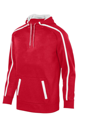
TONAL HOODIE $50 ADULT S-3XL YOUTH S-L RED OR DARK GREY VERY POPULAR